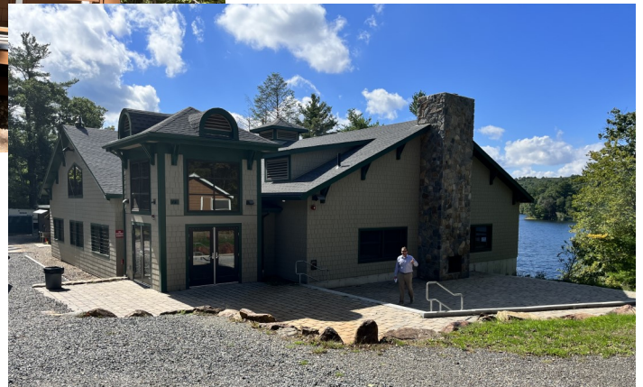
Historical